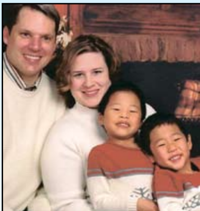
Free Family (Korea), OK