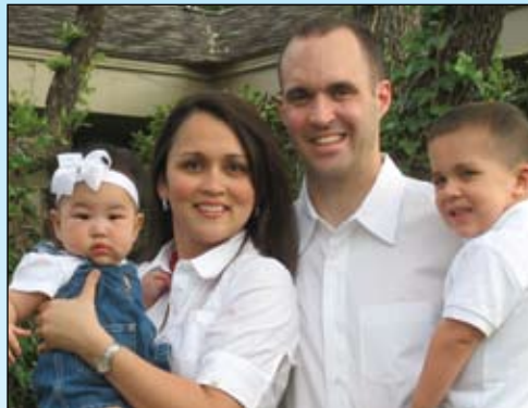
Holt Family (Korea), TX

“Go after a life of love as if your life depended upon it -- because it does.” --I Corinthians 14:1