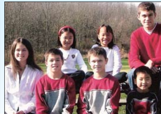
Gentry siblings (Korea), OH