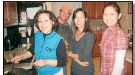
ATLAAS members receive a Korean cooking demonstration at their monthly meeting in Tulsa.