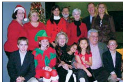
No event is successful without volunteers!

"We loved all of it! We loved the variety of activities for the kids and the families. We really enjoyed volunteering and the opportunity to get to know the Dillon staff & other families."