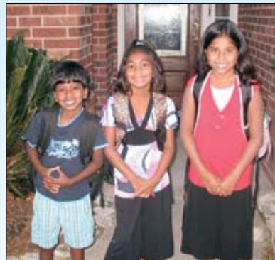
Kodra children on their first day of school (India) TX