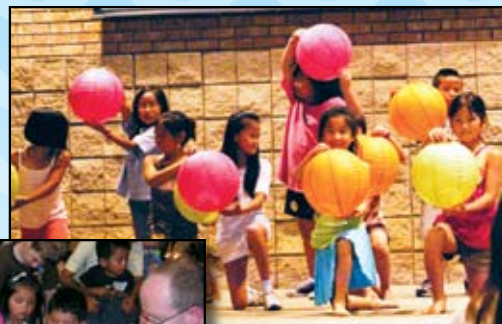
China Campers perform the Lantern Dance