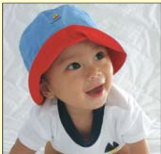
Binhson Hurley (Vietnam) OK