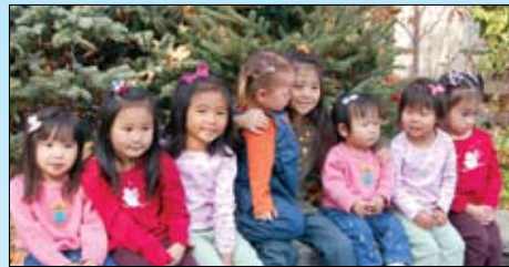
The March 2005 China travel group reunites in Silver Dollar City

"In the morning, O LORD, you hear my voice; in the morning I lay my requests before you and wait in expectation."